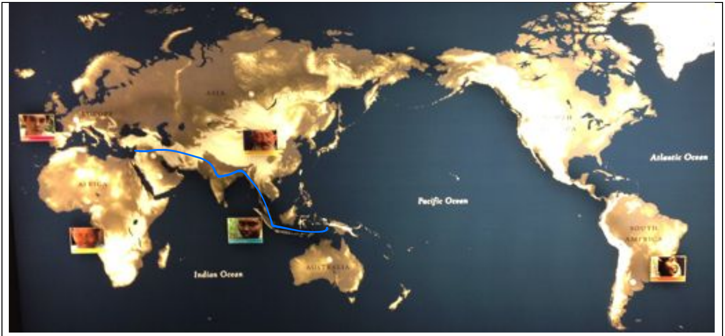
Draw the path that first Americans may have followed to get to North America 20,000 years ago.